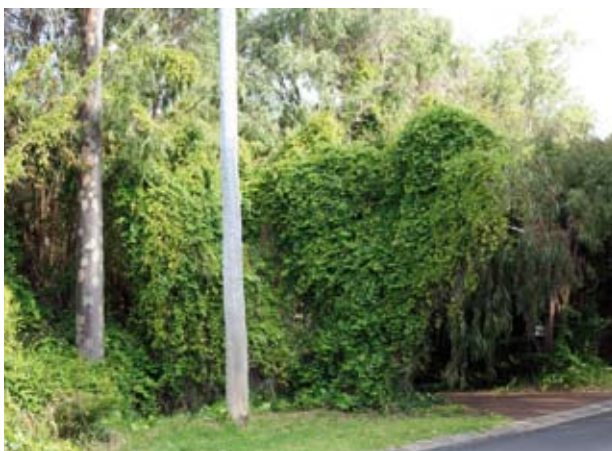
Margaret River townscape streetscape - weeds include Spotted Gum, Ironbark, Victorian Tea Tree, Dolichos Pea, Morning Glory, Ivy.