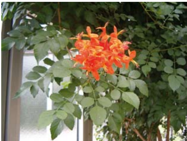
Cape Honeysuckle, Tecoma capensis