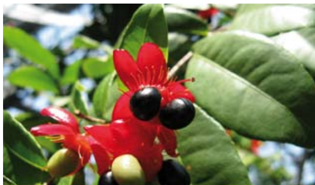
Mickey Mouse Plant, Ochna Serrulata